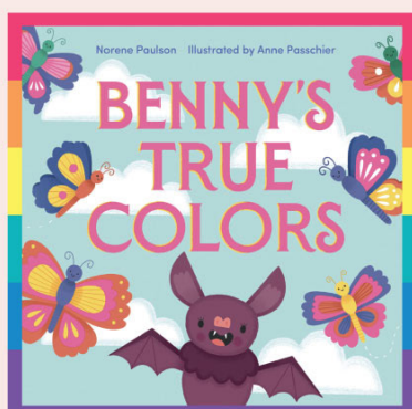
Benny's True Colors by Norene Paulson

This March, the US Air Force announced human rights protections beyond service members to also include their children and family. As an increasing number of states propose laws and pass legislation not only restricting the rights of LGBTQIA+ children, but even criminalizing their existence, the Air Force has intervened on behalf of families during an unprecedented time of anti-LGBTQIA+ sentiment; their support includes securing access to physical and mental healthcare, relocation, and legal support. “The health, care and resilience of our DAF personnel and their families is not just our top priority -