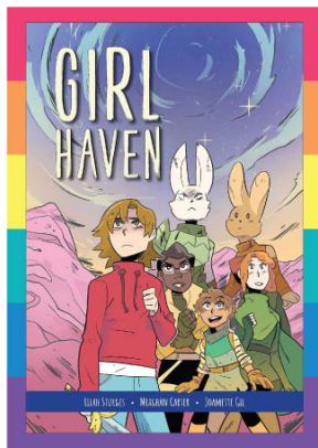
Girl Haven by Lilah Sturges